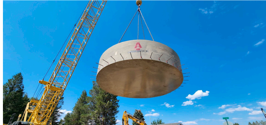
(Clockwise) Leaking water main; New and upsized water main; New sewer pump station holding tank; New protective water tank coating