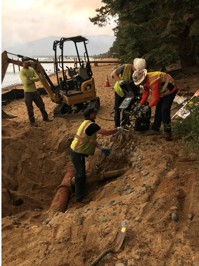
District crews sending a portable camera down the sewer clean out to assess the issue.